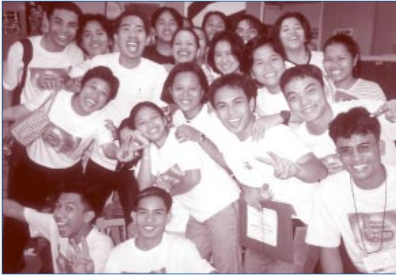
Efforts to improve the quality of reproductive health care for young people are more likely to succeed if young people themselves play an active role in developing innovations. Young adults in the Philippines helped develop a program to teach responsible behavior to their peers.

socioeconomic factors; and to provide unbiased care. At the same time, adolescents need to receive more specific information about fertility and contraceptives and how and where to obtain services at clinics and other venues.