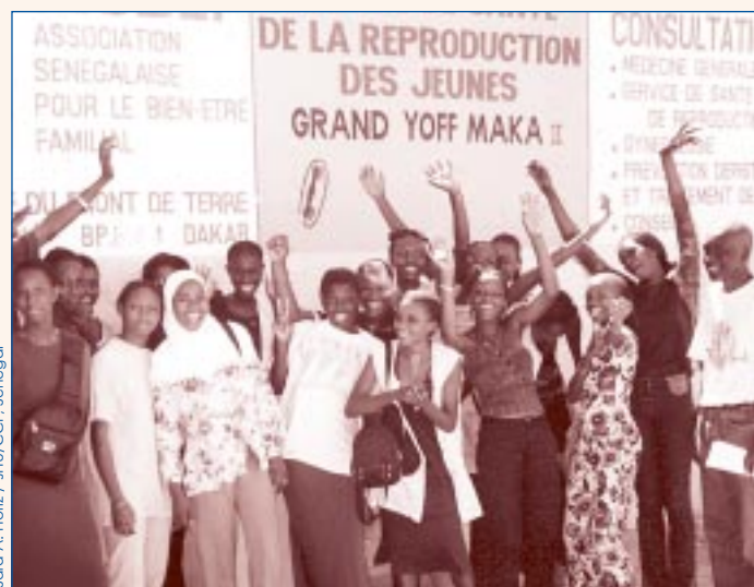
Sara A. Holtz / JHU/CCP, Senegal

During the past decade, in part as a result of the HIV/AIDS pandemic, young people and their health needs have been the subject of greater attention worldwide. International conferences such as the 1994 International Conference on Population and Development (ICPD) have endorsed the rights of adolescents and young adults to obtain the highest levels of health care. In response, more health policies and services are becoming “youth friendly”: Staff are being trained to be more sensitive to the needs of youth, fees for young clients are being reduced, and services and outreach activities are being offered at convenient hours