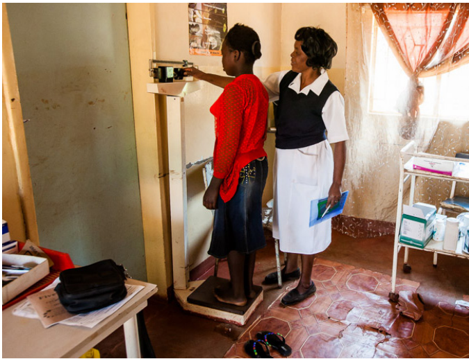
FIGURE 1. NUTRITION OUTCOMES FOR ADOLESCENT GIRLS IN AGEP