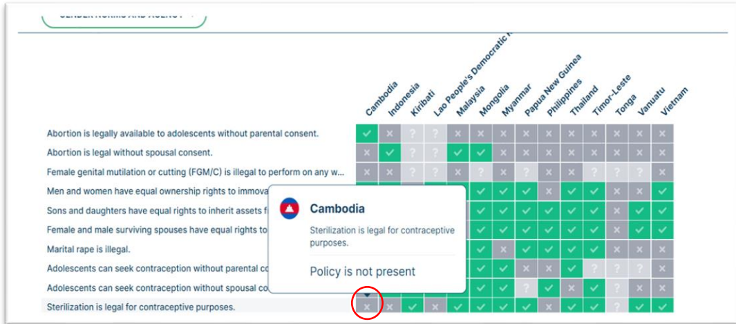
Figure 3 Cambodia has a policy confirming that sterilization is legal for contraceptive purposes.